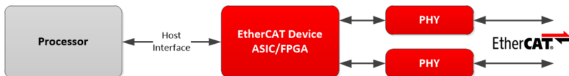
Figure 2: EtherCAT device with an ASIC/FPGA and external processor

An EtherCAT device requires specific Ethernet hardware (EtherCAT MAC) support, as it needs to process incoming EtherCAT frames as they arrive. Typical implementations use ASICs or FPGAs, as shown in Figure 2. This means that the EtherCAT MAC processes the EtherCAT frame while frame reception is ongoing. Typical EtherCAT devices have a 1- \mu s port-to-port delay between received and transmitted frames.